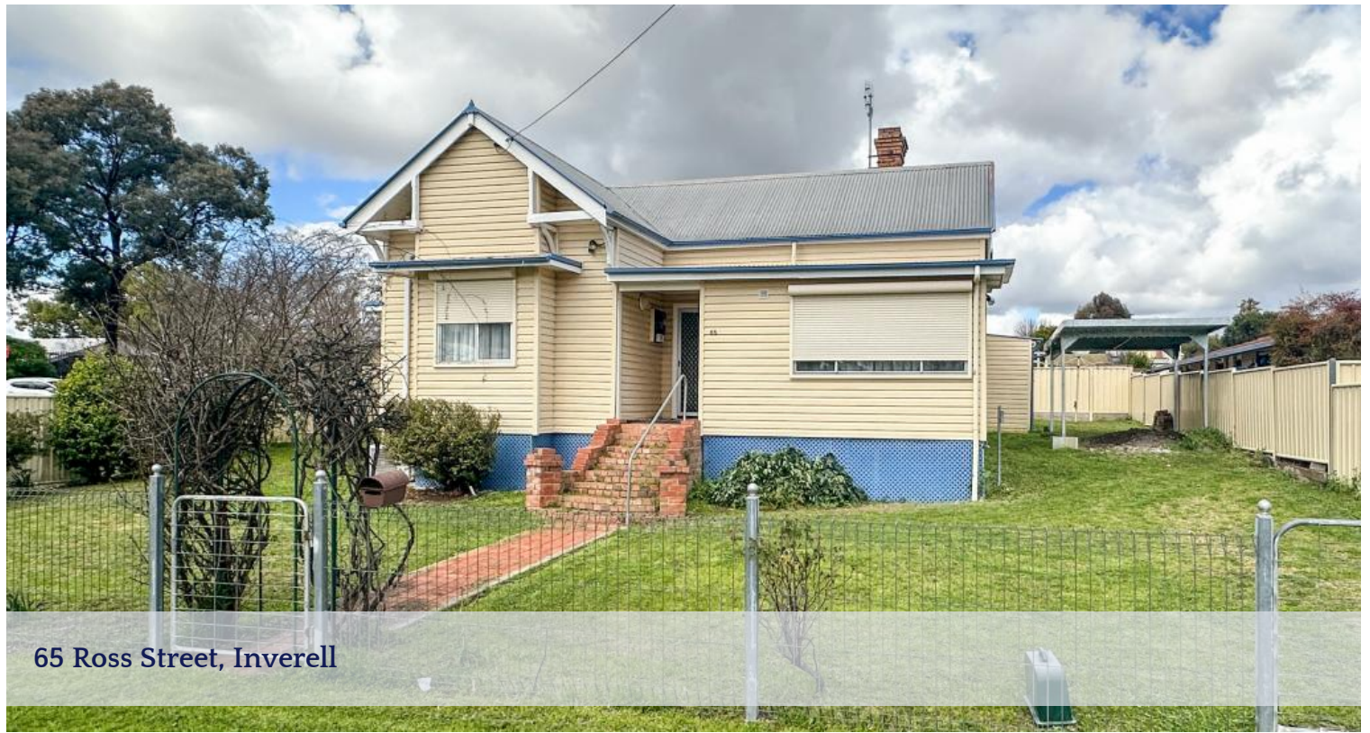
65 Ross Street, Inverell