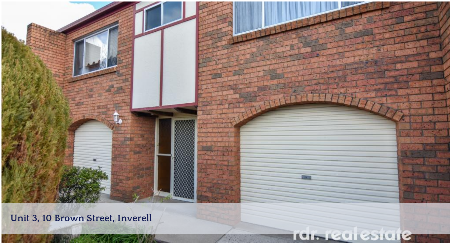
Unit 3, 10 Brown Street, Inverell