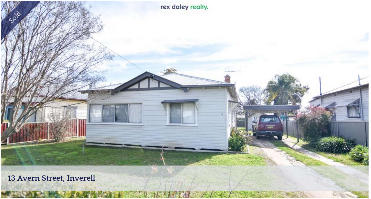
13 Avern Street, Inverell